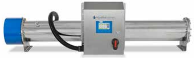
Chamber with panel mounted on the front and connections related to the back